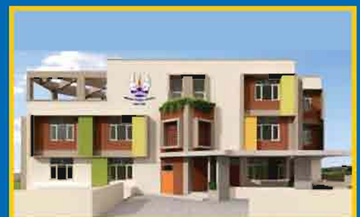
MPS Shradhapuri Phase-II Estd. 2023