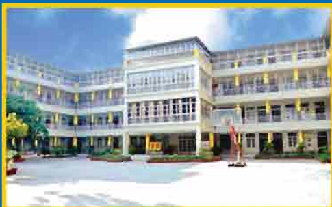
MPGS, Shastri Nagar Estd. 2002