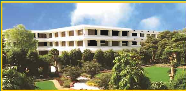
MPS Main Wing, West End Road Estd. 1982