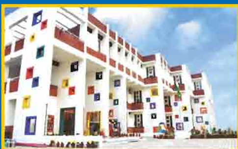
MPS, Ved Vyas Puri Estd. 2016