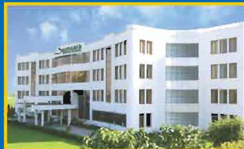
Samsara, Gr. Noida Estd. 2010