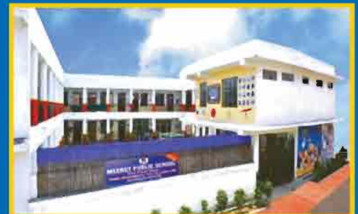
MPS, Shradhapuri Estd. 2013