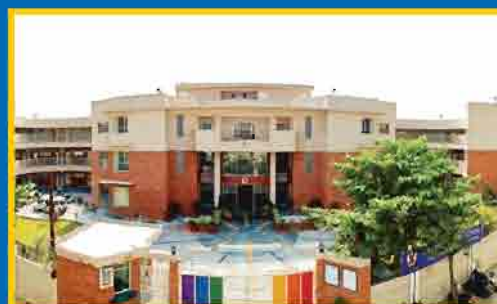
MPS, Pallavpuram Estd. 2020