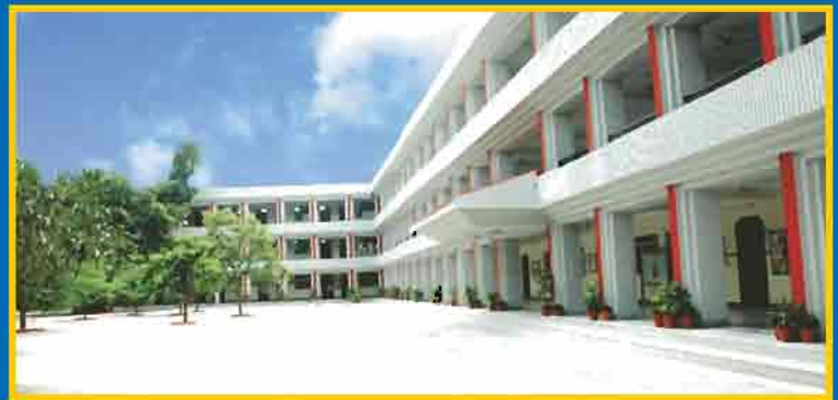
MPSFG, West End Road Estd. 1992