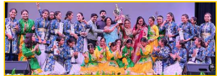
Winners of Rhythmic Rhapsody, First Runners Up of Dance Frenzy