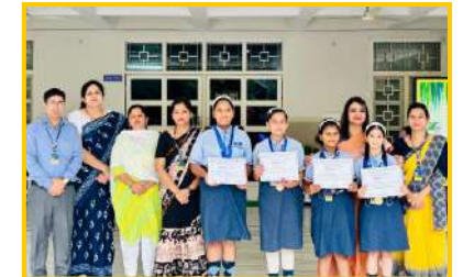
Winners of Khoja Science Competition, Kalakriti held at MPSFG