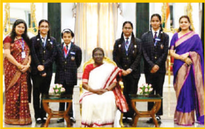
The Management with Honourable President, Smt. Draupadi Murmu ji at Rashtrapati Bhawan.