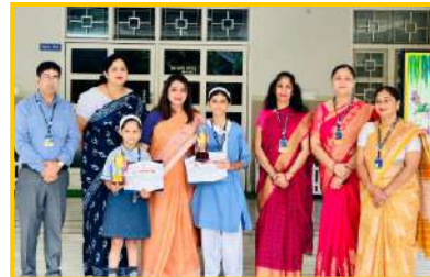
First Runners Up in Quiz O Mania, Expressive Euphoria, MPS Pallav Puram