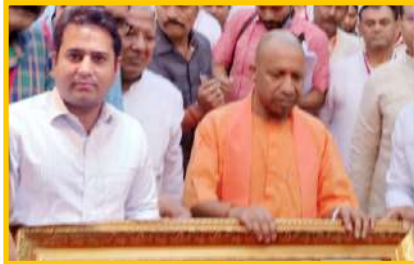
The Management with the Chief Minister of UP, Shri Yogi Adityanath Ji.