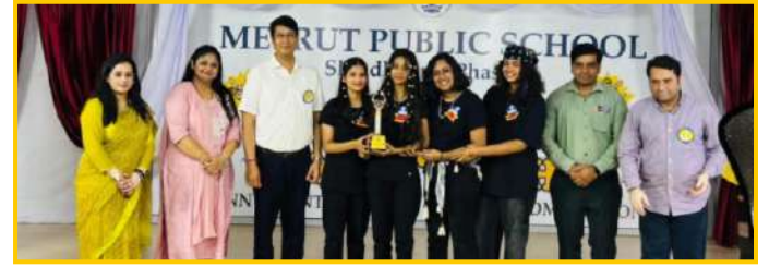
Winners of Rap It Right - MPS Shrdha Puri Phase 2