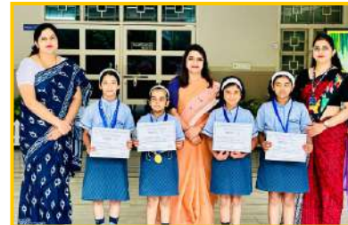
Second Runner Up of Nutritious Delight Competition, Kalakriti held at MPSFG