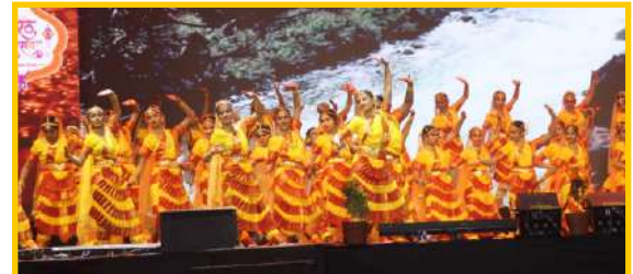
Students of Meerut Public Girls' School, Shastri Nagar performing at Meerut Mahotsav