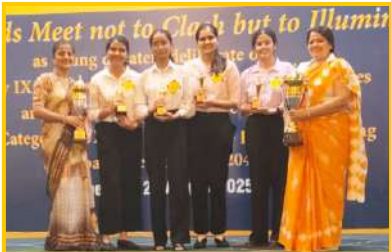
First Runners Up of VI DP Singh Memorial English Debate