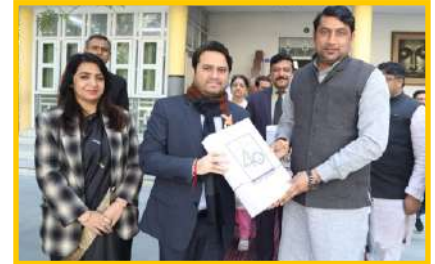
The Management with Dr. Somendra Tomar, Minister of State for Energy, UP Government.