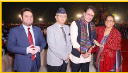
The Management with Shri Arun Govil ji, Member of Parliament.