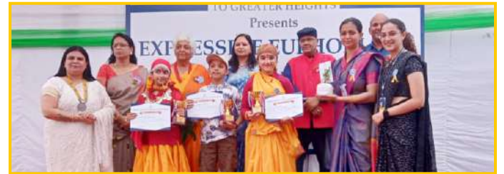
Winners of AI Cultural Parade - Expressive Euphoria MPS Pallavpuram