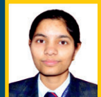
YASHIKA AIR - 261673 Marks - 375