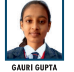
GAURI GUPTA Government Medical College (GMC), Ayodhya